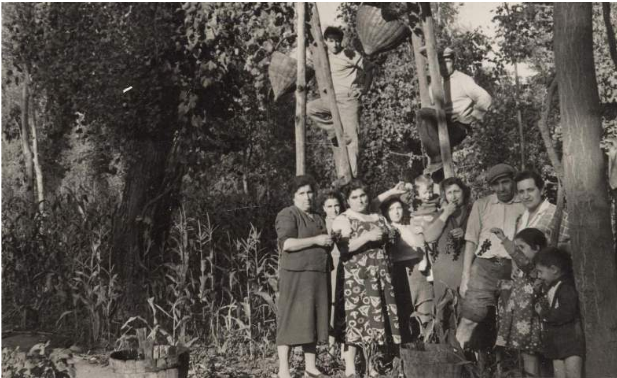
La Vendemmia Grape picking